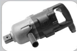
TOOL & EQUIPMENT