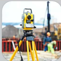
SURVEY & ENGINEERING SUPPORT