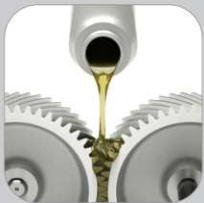
OILS & LUBRICANTS

WE PROVIDE HIGH QUALITY PROVEN PRODUCTS & SERVICES FOR REMOTE OIL & GAS OPERATIONS