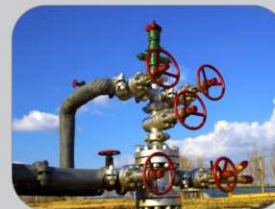
OIL FIELD PARTS